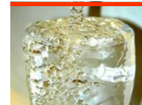
Jegtvig, S. Drinking Water to Maintain Good Health, 2007

It may be difficult to drink enough water on a busy day. Be sure you have water handy at all times by keeping a bottle for water with you when you are working, traveling, or exercising.